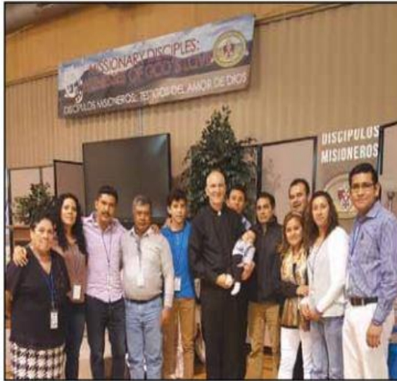
Group gathering at the V Encuentro Experience in Casper.

The Diocese V Encuentro took place on October 6 and 7, 2017, in Casper. We had 123 people in attendance from around the Diocese. The V Encuentro Experience represents an important step in the formation of identity of the Latino community of the United States and the Diocese. For the Diocese of Cheyenne, where the Latino presence has been on the rise in recent years, the diocesan Encuentro meant the opportunity to gather leaders from the parishes that have been working in community formation. It is an important step in the way of consolidating the community, strengthening the roots of the faith, sharing diverse experiences and